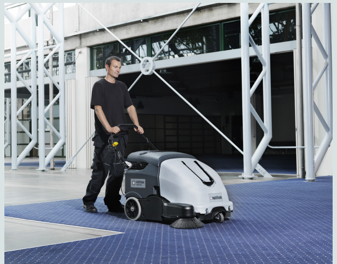
For high-traffic carpeted areas from conference rooms to hallways, the quiet and powerful SW900 floor sweeper offers you high cleaning performance and productivity.

Portfolio of over 125 cleaning solutions