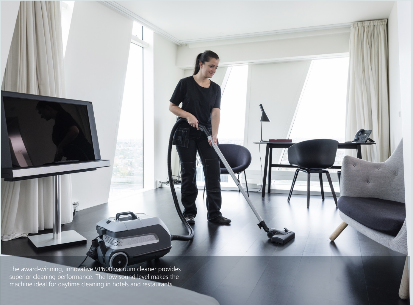
The award-winning, innovative VP600 vacuum cleaner provides superior cleaning performance. The low sound level makes the machine ideal for daytime cleaning in hotels and restaurants.