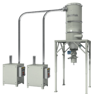
CENTRALIZED VACUUM SYSTEMS