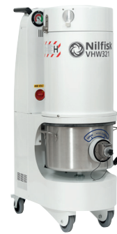
FOOD AND PHARMA