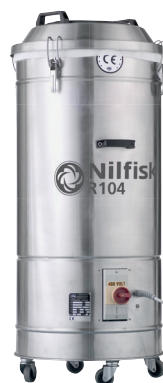
PACKAGING AND TRIMS