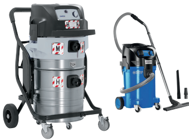
HEALTH AND SAFETY WET AND DRY