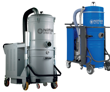
THREE-PHASE WET AND DRY