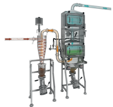
DUST CONTAINMENT SYSTEMS