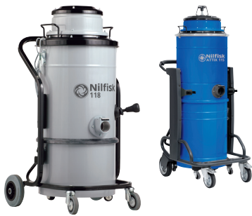
SINGLE-PHASE WET AND DRY